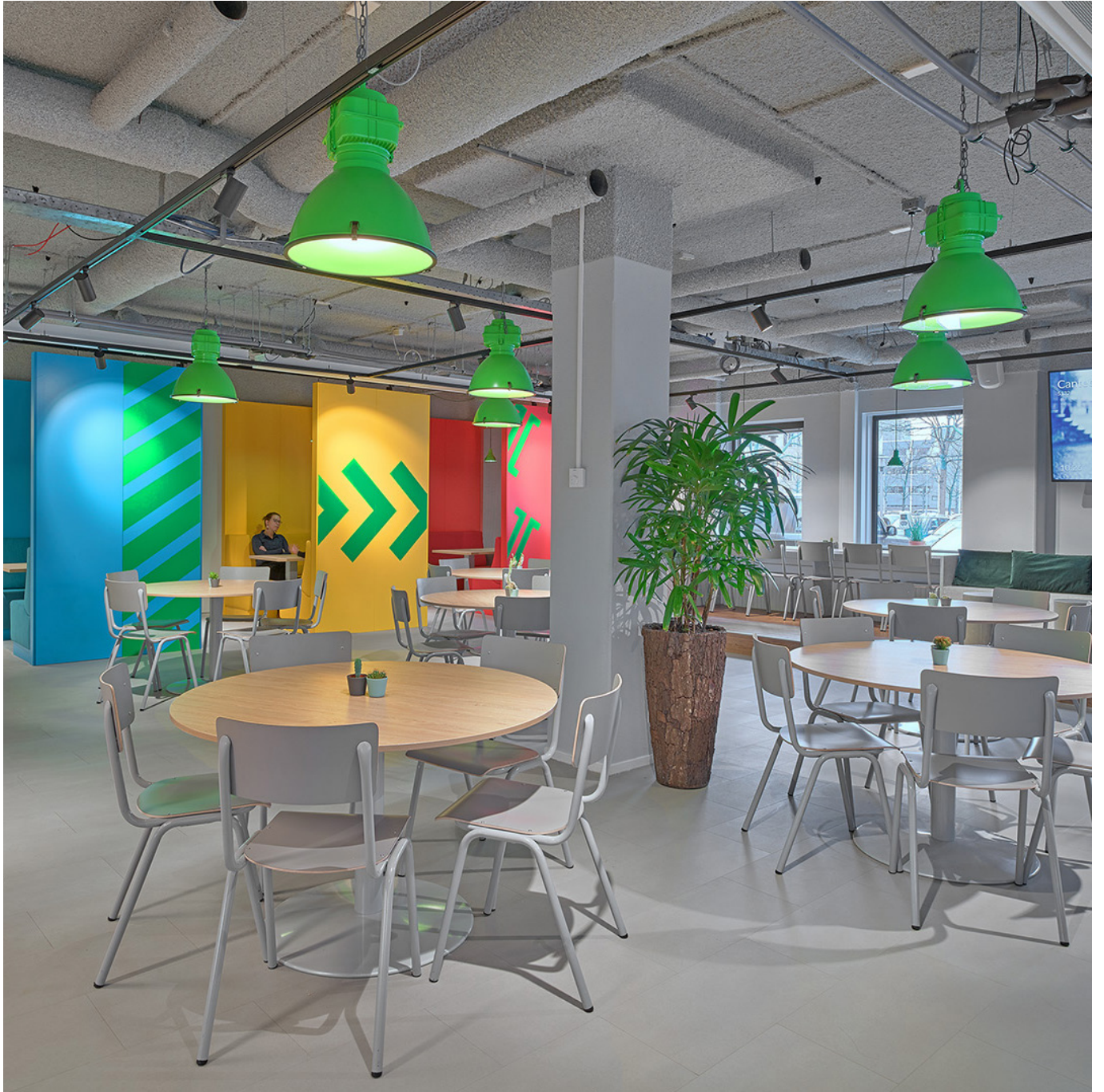
ParcNow office in Amsterdam, The Netherlands