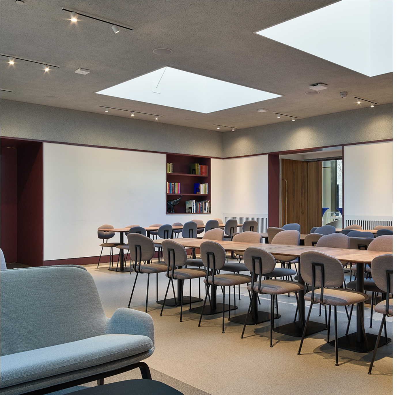
KNAW in Amsterdam, The Netherlands